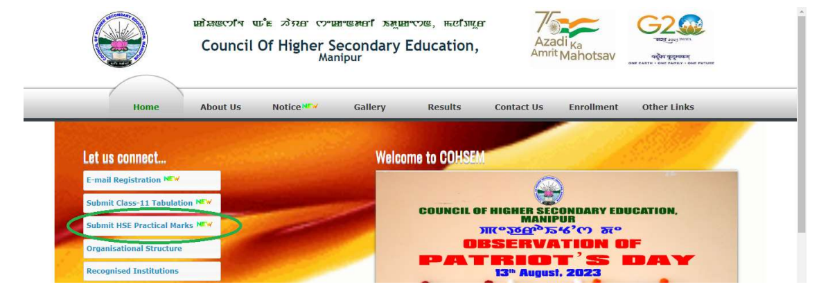
Step-3: A new page will open. Follow the instructions to submit the required digital artifact.

Step-2: Click the Link "Submit HSE Practical Marks" on the COHSEM's home page.