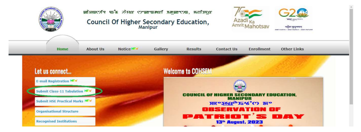
Step-3: A new page will open. Follow the instructions to submit the required digital artifact.