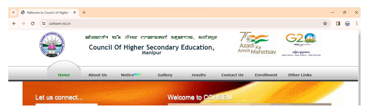
Step-2: Click the Link "E-mail Registration" on the COHSEM's home page.

Step-1: Open the COHSEM's website, <a href="https://cohsem.nic.in/">https://cohsem.nic.in/</a> from the browser.